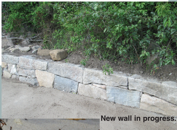
New wall in progress.