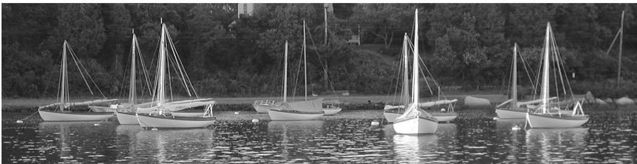
Lovely Herreshoff 12 1/2-footers swing gracefully on their moorings just off the Land Trust dock.