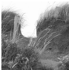
What starts as a small trail can cause major erosion. Please respect trail closures.

It is now our responsibility to protect this beautiful piece of land for the enjoyment of all. Please stay on the main trails and stand well back from the rocks on the Knob's lookout point. Please don't throw rock and stones from armored areas. The vegetation of the woods and on the beach is what keeps the soil and sand from getting blown and washed away.