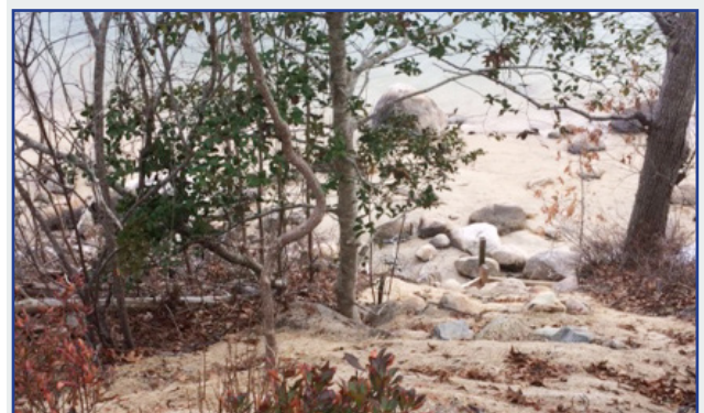
Harbor-side ravine repair

As you know, our Comprehensive Permit was approved by the Falmouth Conservation Commission last summer. At that time we sent contractors requests-for-proposals to address erosion and path-maintenance issues. We chose Crawford Land Management, a company located in Mashpee that works to restore native habitats. Jointly with Salt Pond Areas Bird Sanctuaries, we hired the company to manage eight maintenance and erosion-control projects as part of our long-range Management Plan. The work, which is of high quality, started last fall and is scheduled for completion this fall. Members will see the results if they take a walk on the Harbor-side paths.