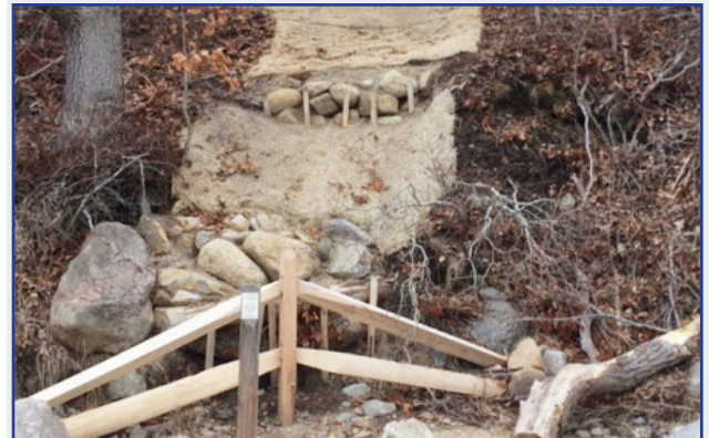
Fencing and trail closure