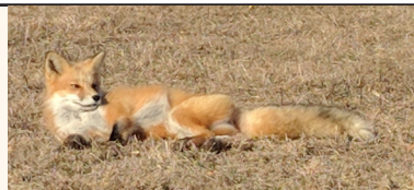
A mother fox and her kits have taken up housekeeping on the Knob.