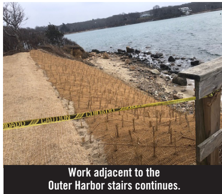
Work adjacent to the Outer Harbor stairs continues.