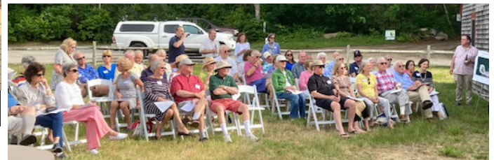
Members gather at Annual Meeting.