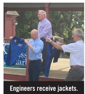
Engineers receive jackets.