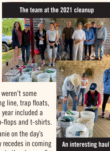
The team at the 2021 cleanup