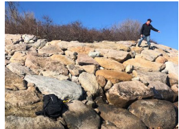
Carlos Pena from Foth Engineering inspects damage to Northeast Wedge.