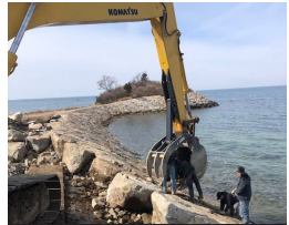
The team from C. F. Briggs Marine Construction places one of the large armor stones on the last 118 feet.