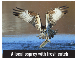
A local osprey with fresh catch