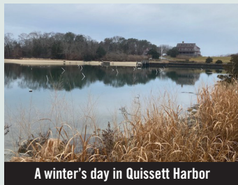
A winter's day in Quissett Harbor